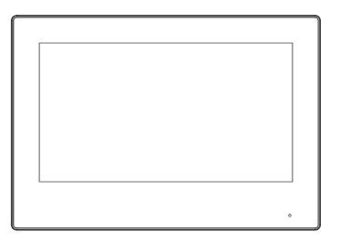
Figure 1-1 Front panel